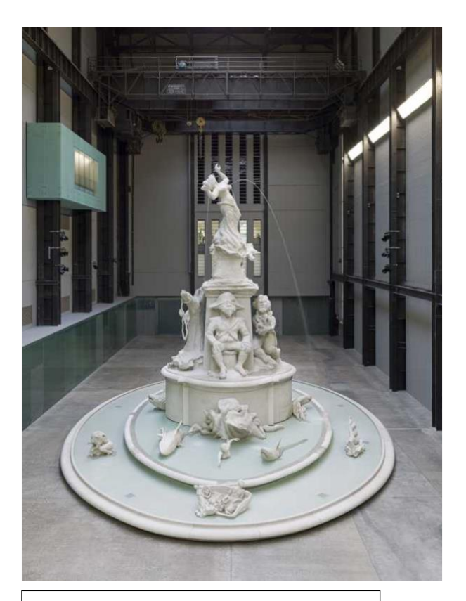
(1) Kara Walker's Fons Americanus (2019).

description of the artwork, and goes on to consider the narratives and allegories present in the piece, showing how Walker combines them to destabilise colonial power. The second part of this essay will evaluate her success in that aim, by assessing the following three criticisms: does Walker's monument succeed in reaching her intended audience, given where it is situated and its temporary nature? Does the placement of her monument within an institution itself undermine her goal? And moreover, does her use of imperial imagery undermine her goal to forge narratives separate from the coloniser? I conclude that these criticisms do not hold merit and Walker's installation does successfully destabilise structures of colonial power.