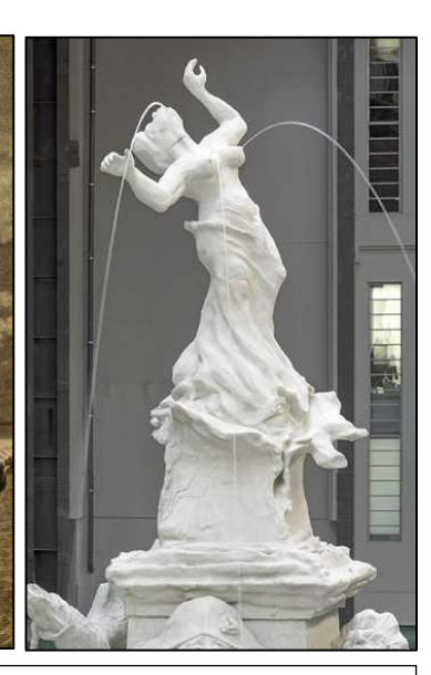
From left to right: (2) Sir Thomas Brock, Winged Victory atop the Victoria Memorial (1911); (3) Thomas Stothard's illustrated Sable Venus (1793); (4) Kara Walker's Venus atop Fons Americanus (2019).

The figure of Venus makes clear how Walker's dual-challenge works. Her artwork challenges viewers to notice the prevalence of memorials celebrating colonial power, by presenting a counter-memorial that reclaims racist imagery and builds in new symbolism. This is particularly apparent in geographical centres of colonial significance such as London, which, while not a port city, was the symbolic centre of the British Empire and represented England's dominion throughout the globe. In challenging its viewers, the artwork challenges structures of power themselves, questioning their dominance and continued pervasiveness.